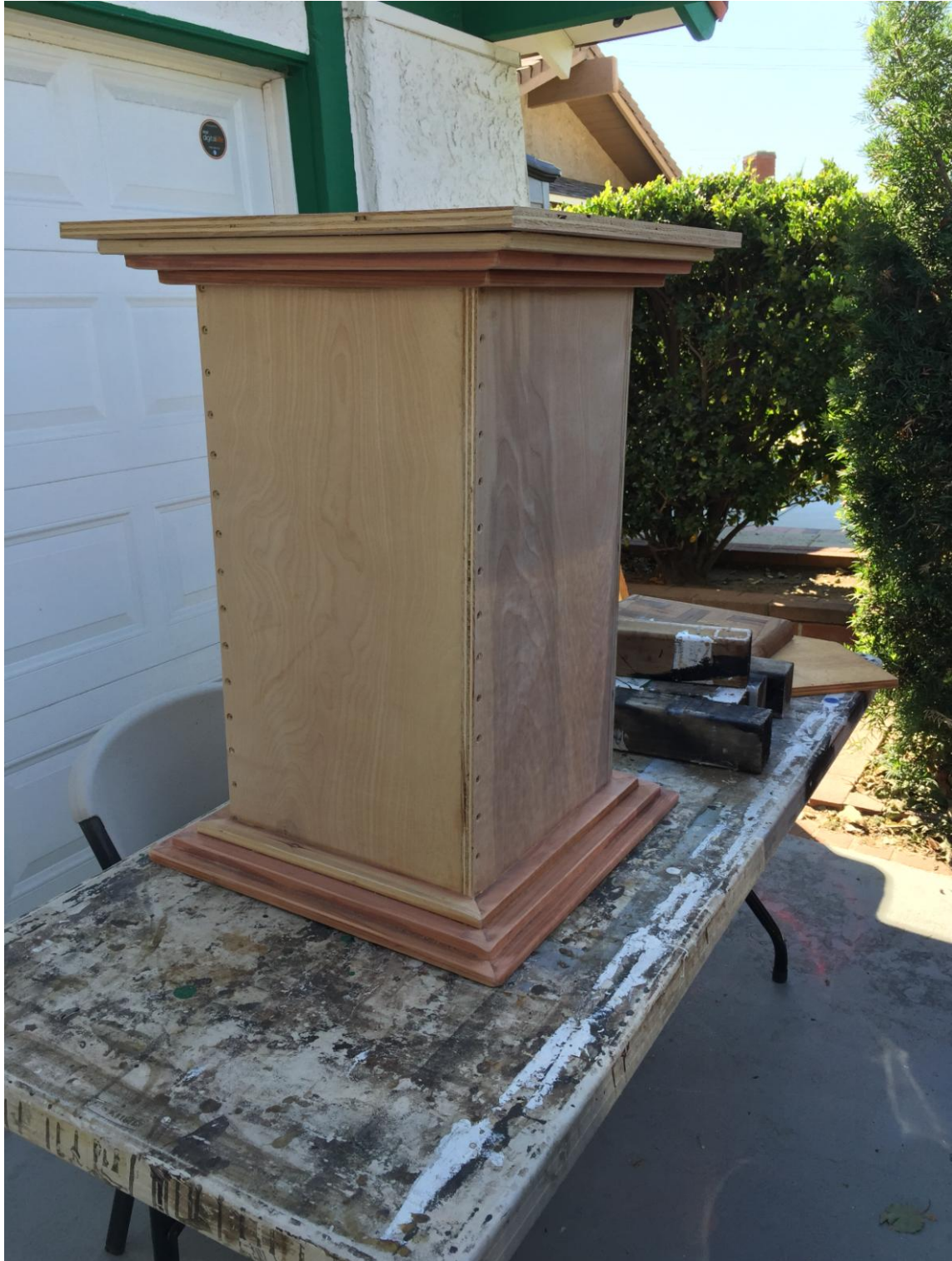
Completed stand - lightly sanded; awaiting trim to cover screw holes and plywood edging; redwood pieces have been mitered at 45 degrees and then glued/screwed onto birch veneer panels