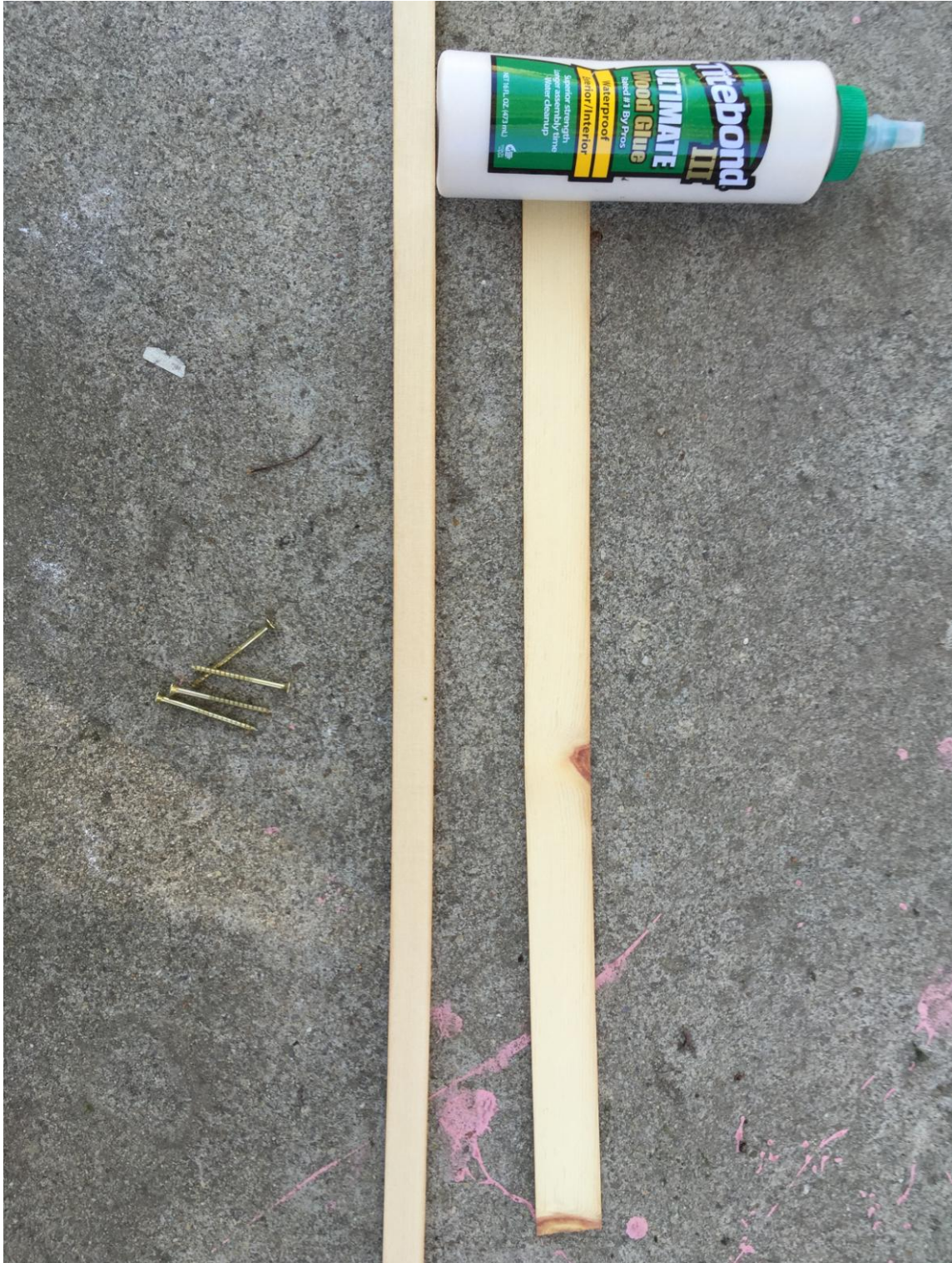
1/2 inch by 3/4 inch oak; 1 inch by 1/4 inch strip of Douglas Fir; SPAX screws (2 inch); Titebond III wood glue