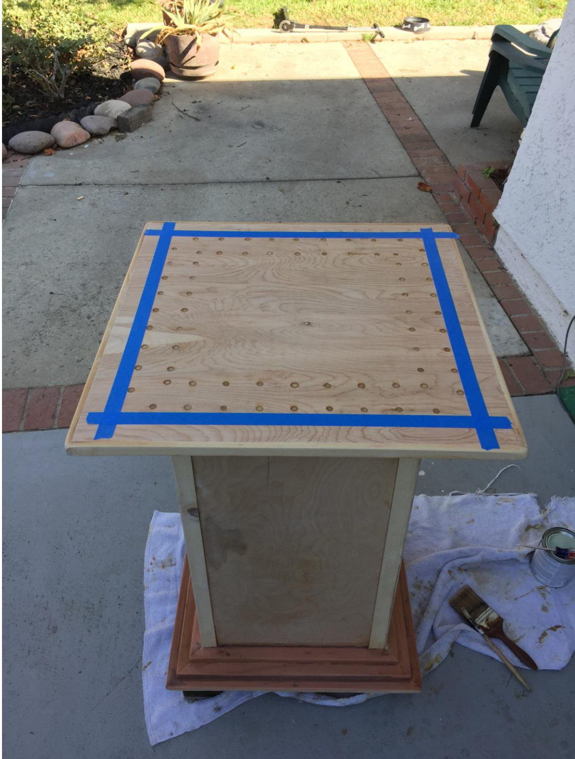
Stand tape prepped for enamel - 1 coat of gray, then two coats of black enamel paint (notice that screw holes have Titebond III filling them as a wood filler)