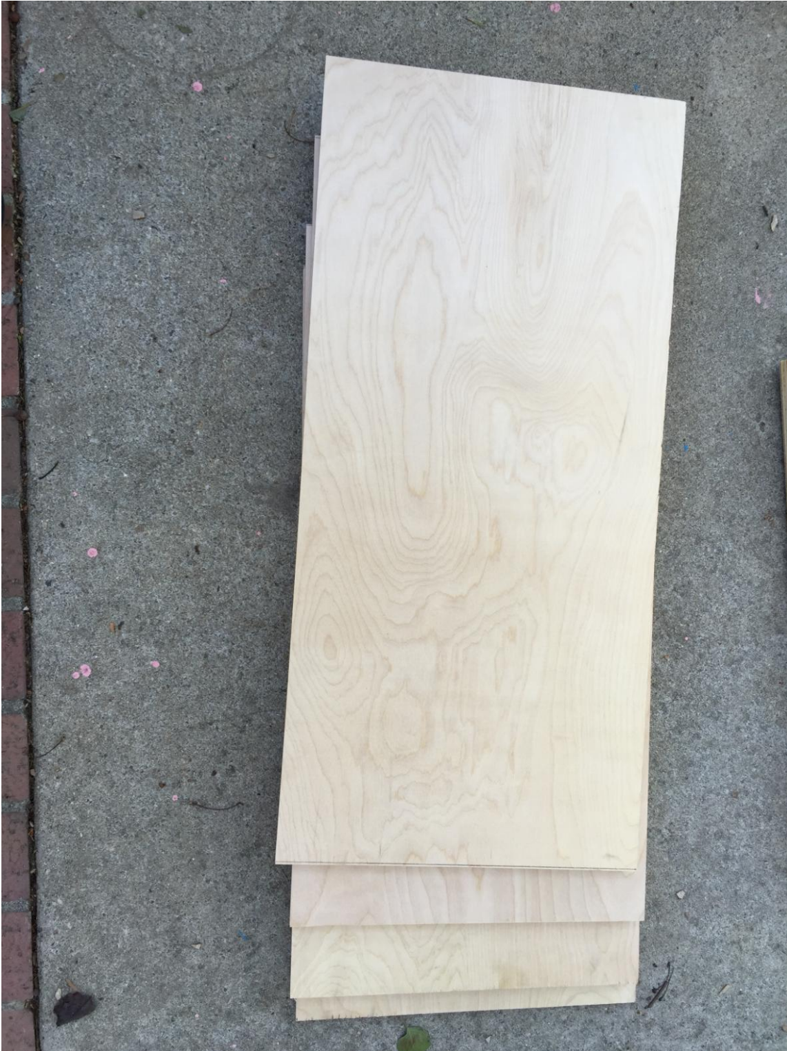
Cut birch veneer - 15 inches by 32 inches