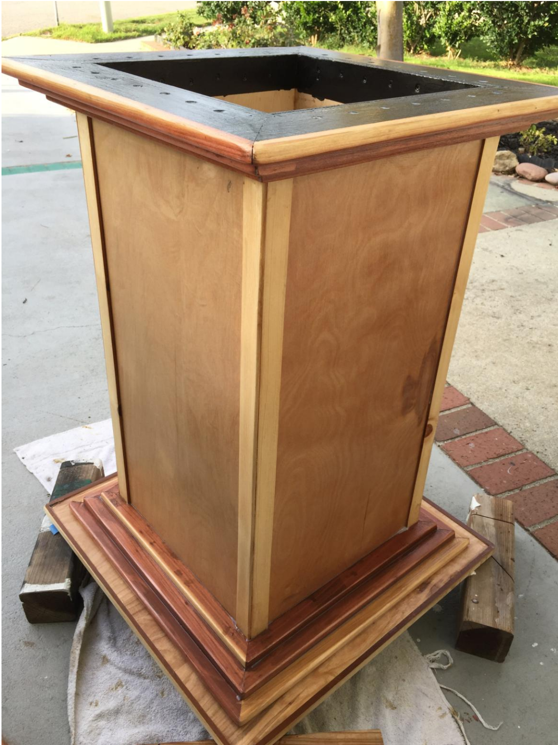
UPSIDE DOWN view of finished stand - awaiting drying and then another coat of 3X Varathane