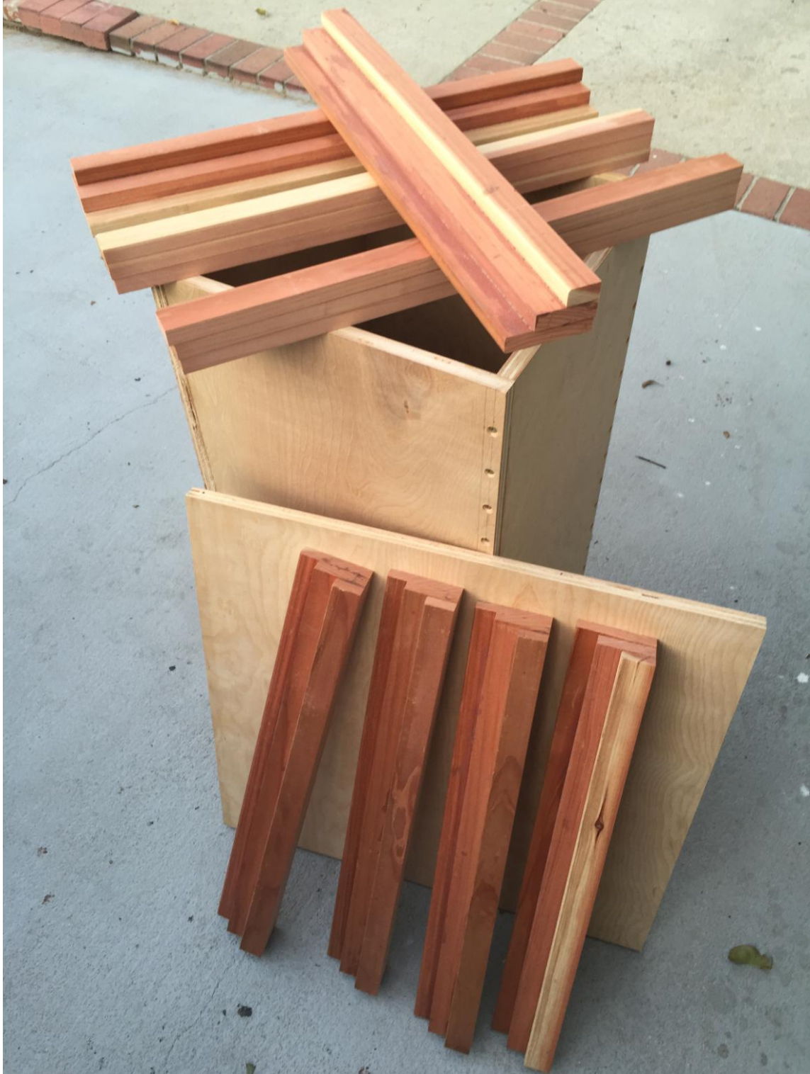
Eight redwood pieces - slightly trimmed with table saw to remove residue from glue-up stage