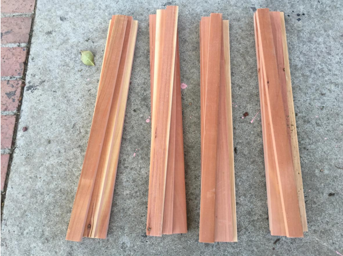
Cut redwood pieces - awaiting glue-up and fastening with SPAX 1 1/2 inch screws