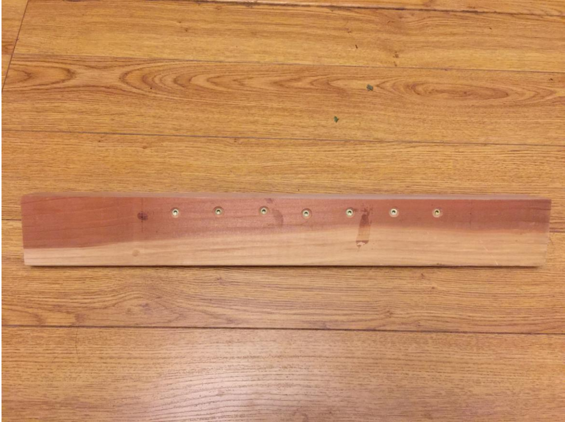
Bottom of largest redwood piece - SPAX 1 1/2 inch yellow zinc screws