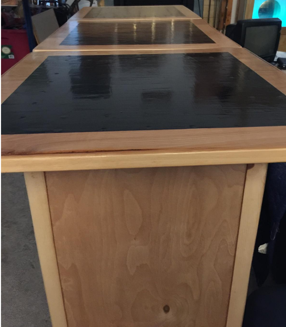
Three stands; close up view - note the unique wood blemishes and characteristics highlighted by the clear coat of Varathane