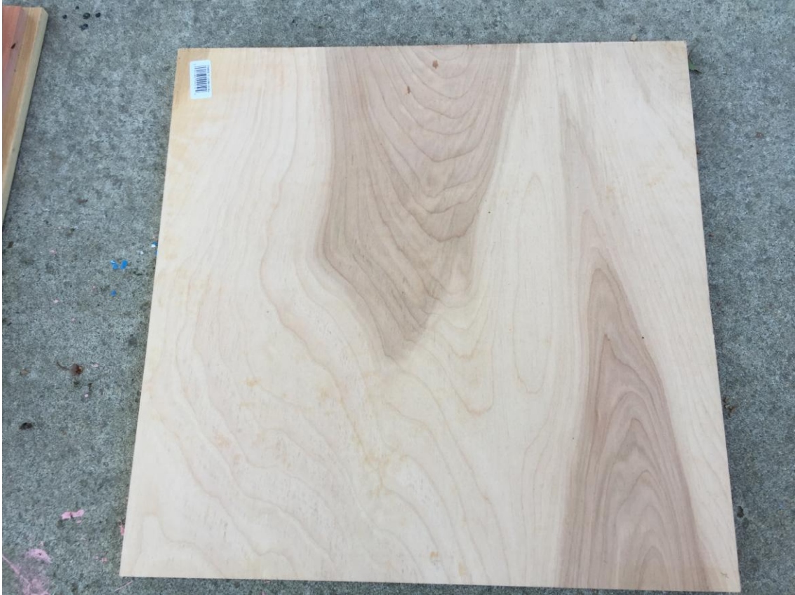
Unprepared birch veneer - 24 inches by 24 inches (top base)