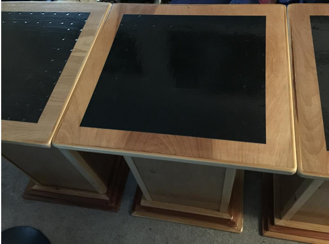
Three completed stands; awaiting shipping