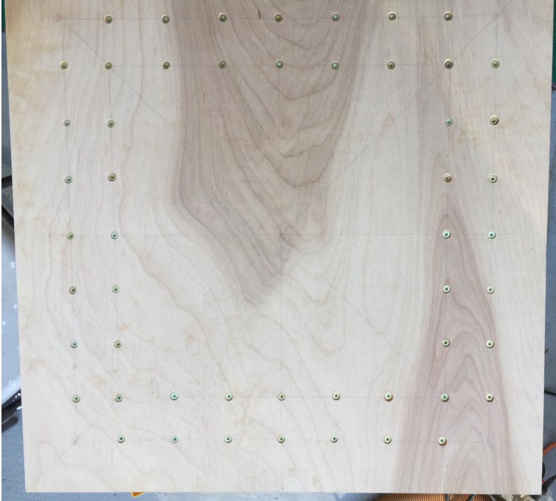
Top base with countersunk holes for 1 1/2 inch T20 yellow SPAX fasteners - mounted 2 1/2 inches away from each other; 7.5 inches plus/minus from center; 9.5 inches plus/minus from center of 24 * 24 inch birch veneer board