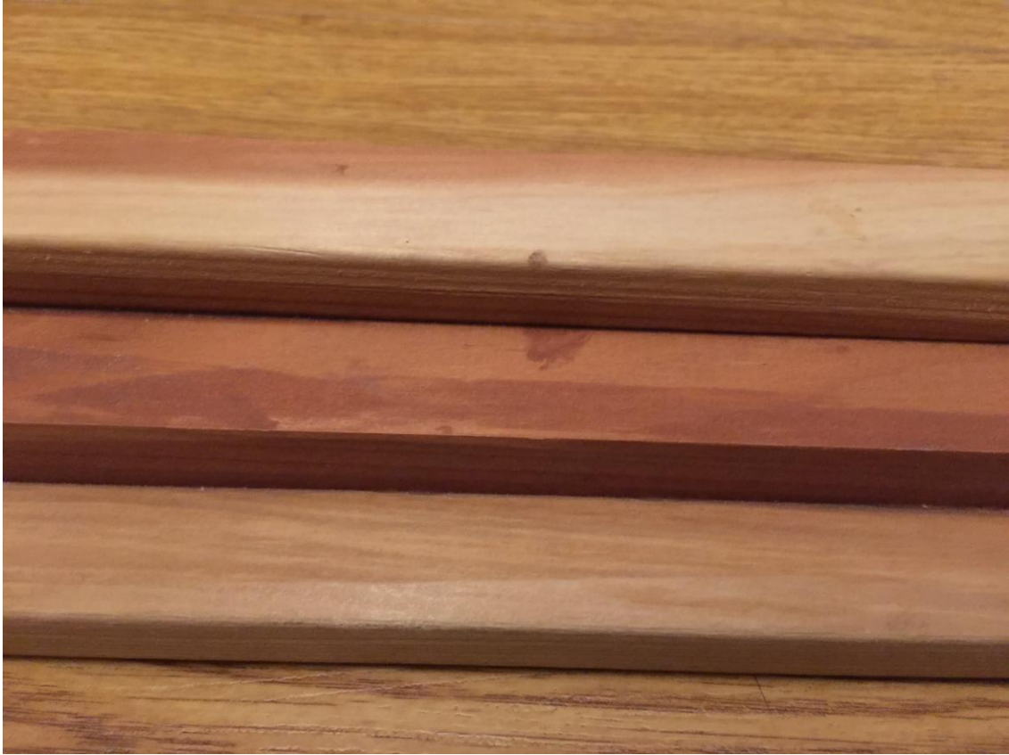
Close-up of redwood trim