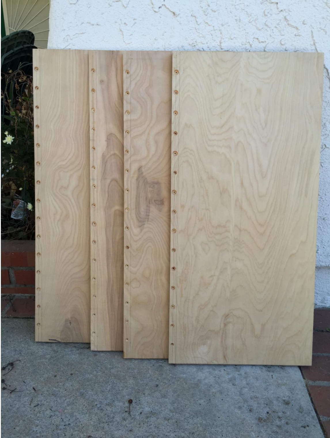
Cut, drilled and countersunk - birch veneer sides measuring 15 inches by 32 inches