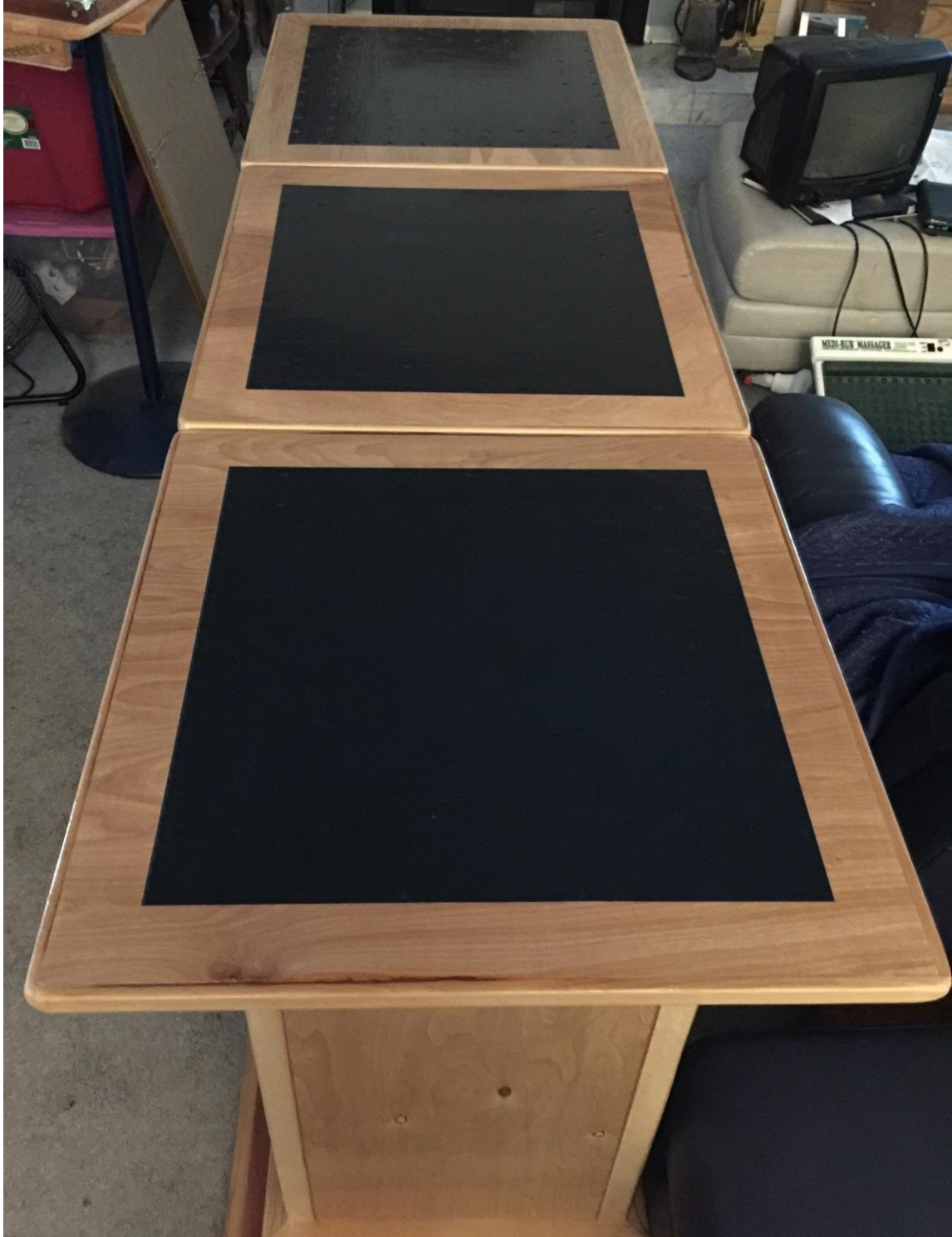
Three stands: birch veneer, oak trim, Douglas fir trim, redwood top/bottom