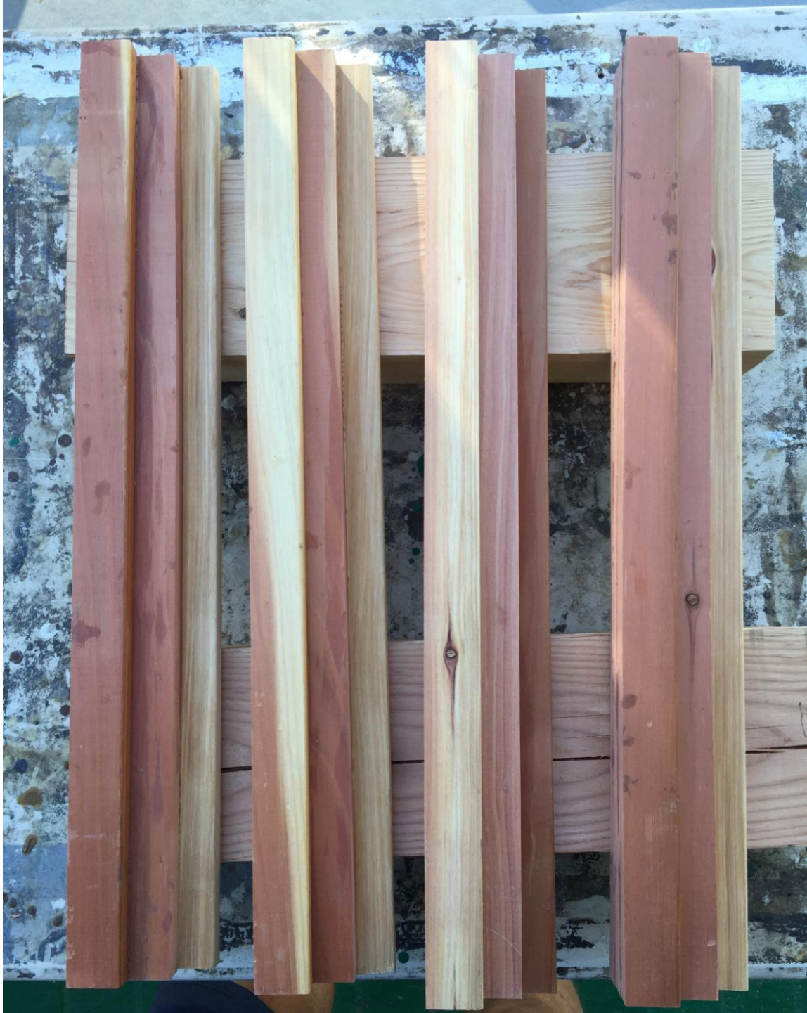
Redwood strips - cut to 24 inches and glued in sets of three (1 5/16, 2 5/16, 3 5/16) from an eight inch (nominal) board, 7.25 (actual)