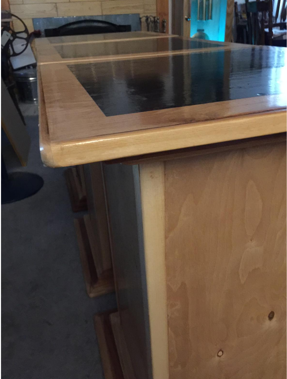
Three completed stands; close up view