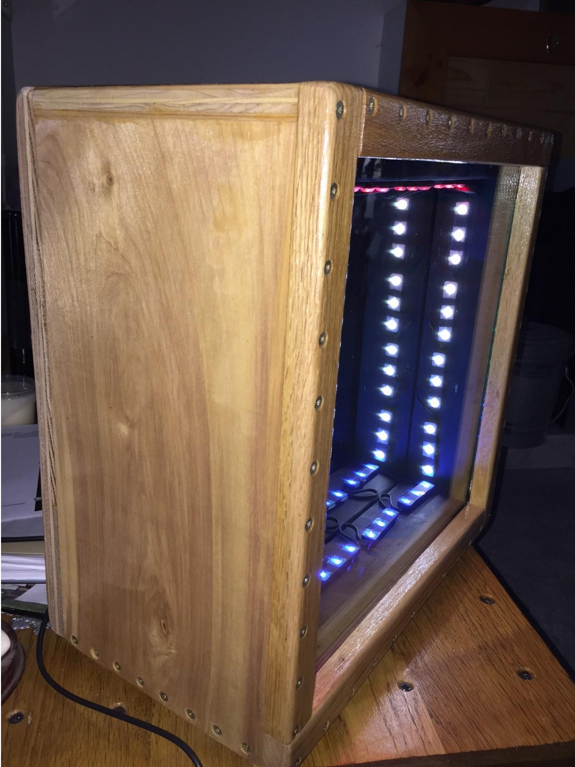
Construction of Left Side (the right side is similar)